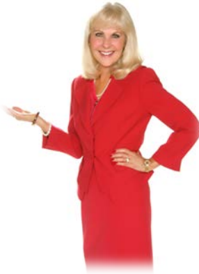
Are You Developing High Potential Leaders?